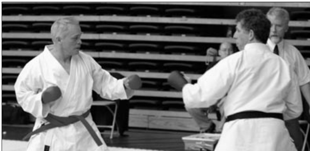
Open photos courtesy of Onelegwest design