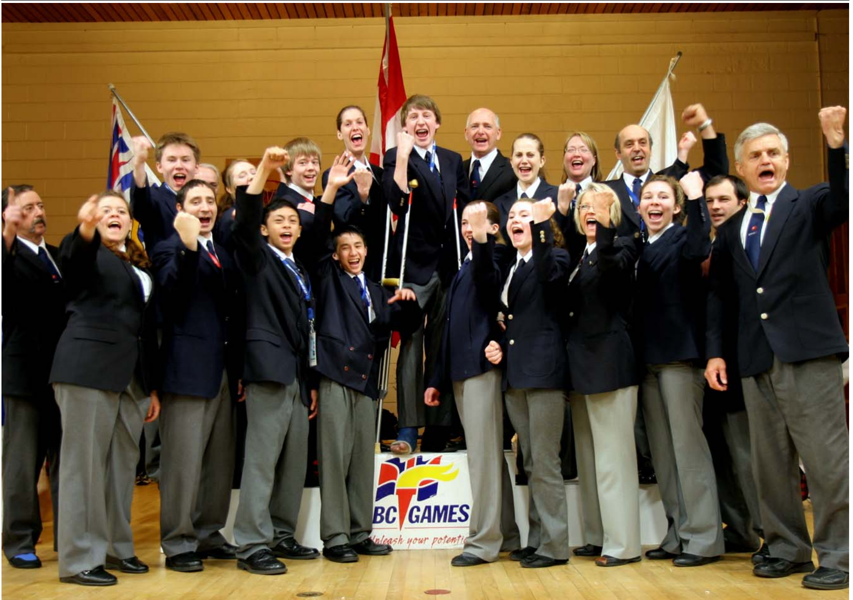
Karate BC officials made a strong showing at the 2010 BC Winter Games. The 2012 BC Winter Games will take place Feb. 23-26 in Vernon. Athletes must be 12 or 13 years of age as of February 23, 2012 to take part.