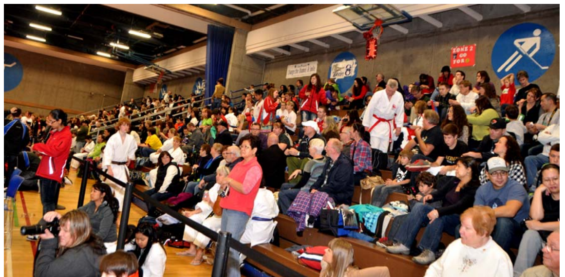
Our Provincials held at the end of November attracted good crowds