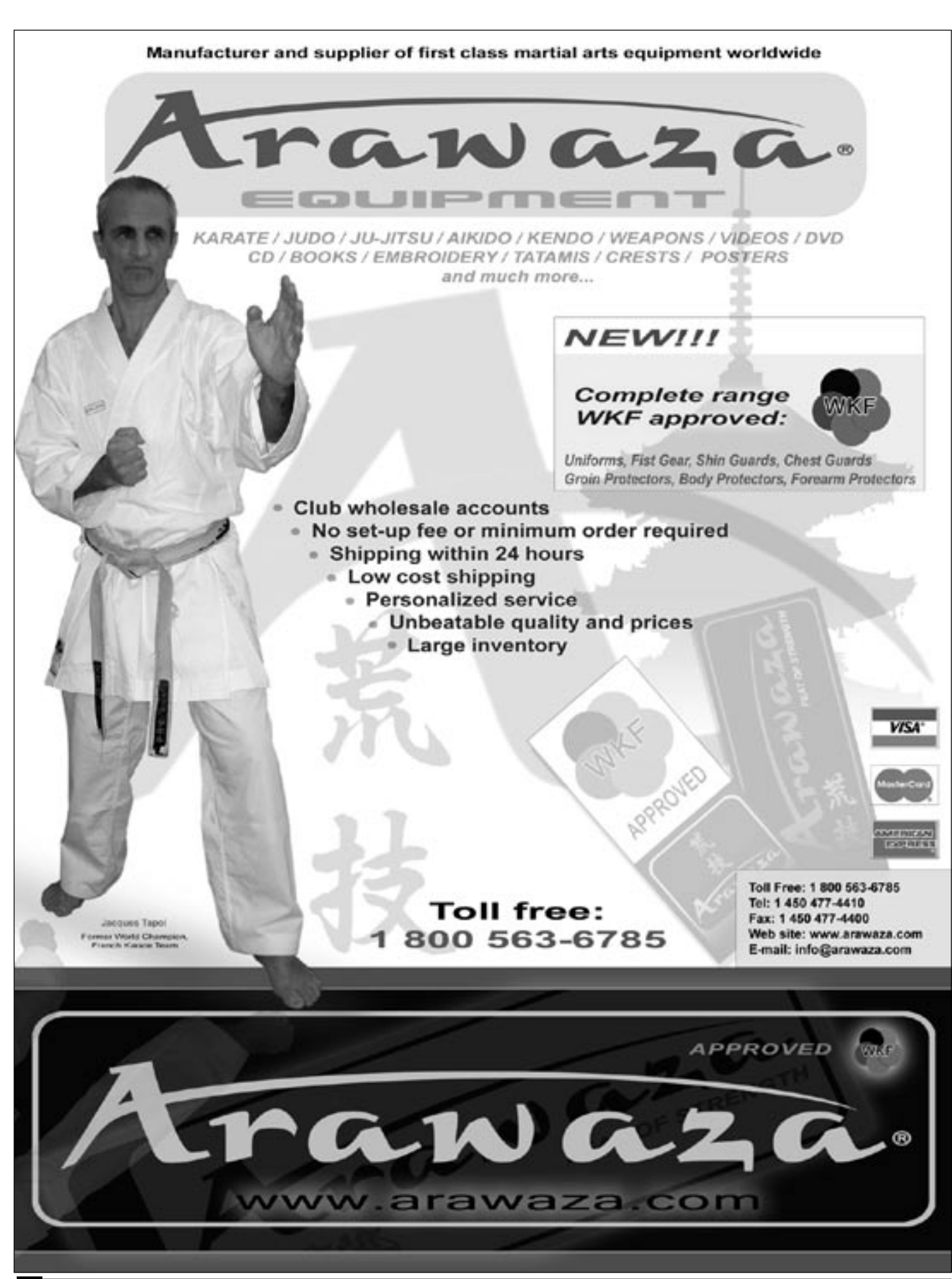
KARATE BC NEWS, SUMMER 2008